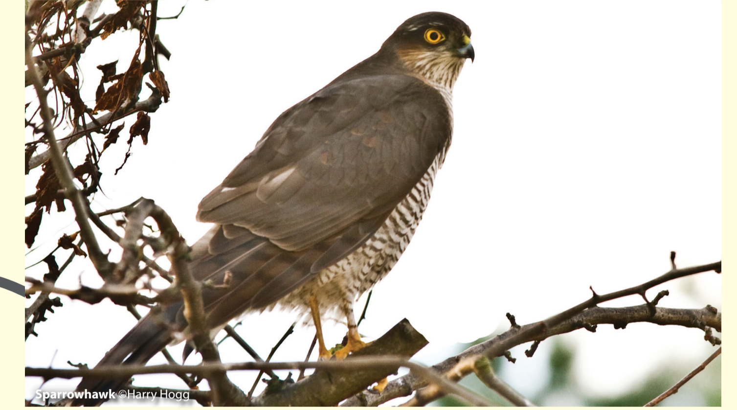
Sparrowhawk