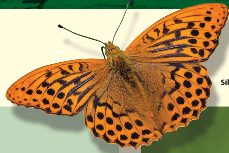
Silver Washed Fritillary