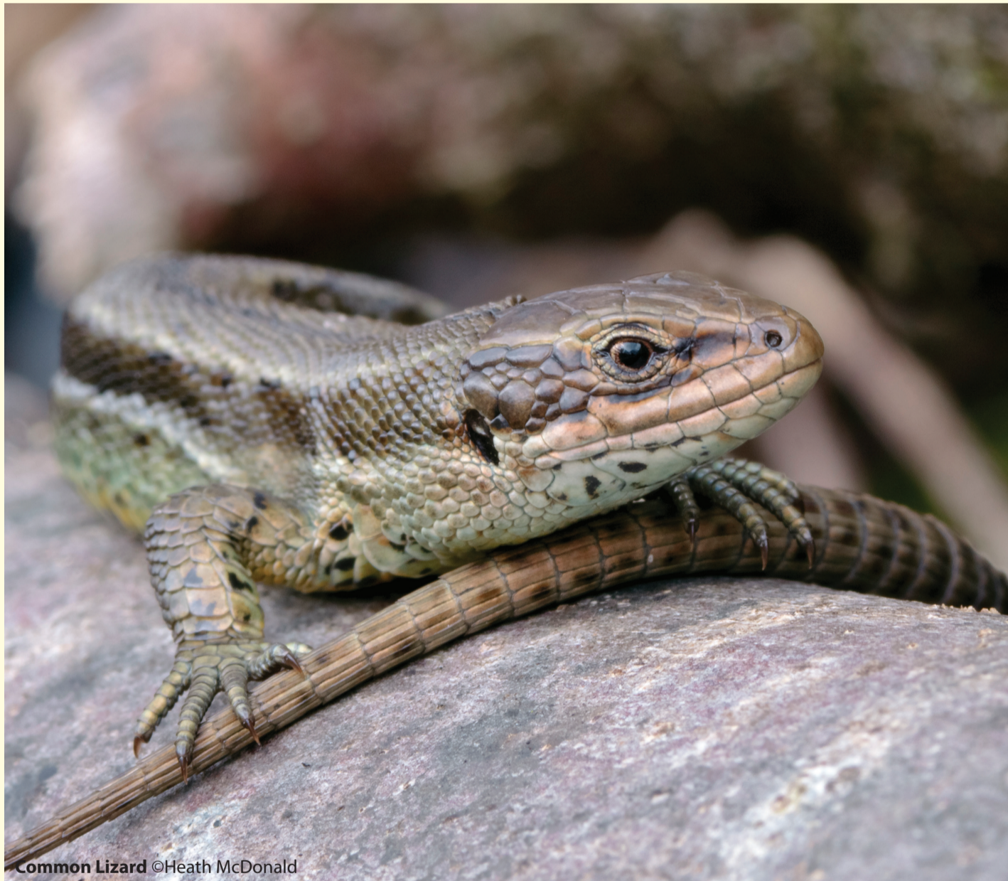
Common Lizard

Langford Heathfield Nature Reserve is a 226 acre (91.6 hectare) Site of Special Scientific Interest (SSSI). It comprises areas of heathy grassland, Bracken, Willow and Birch scrub and Oak and Ash woodland.