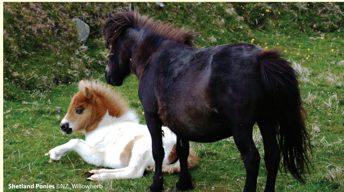
Shetland Ponies

The glades and paths are kept open by annual cutting and the cutting of blocks of Bracken on a three year rotation.