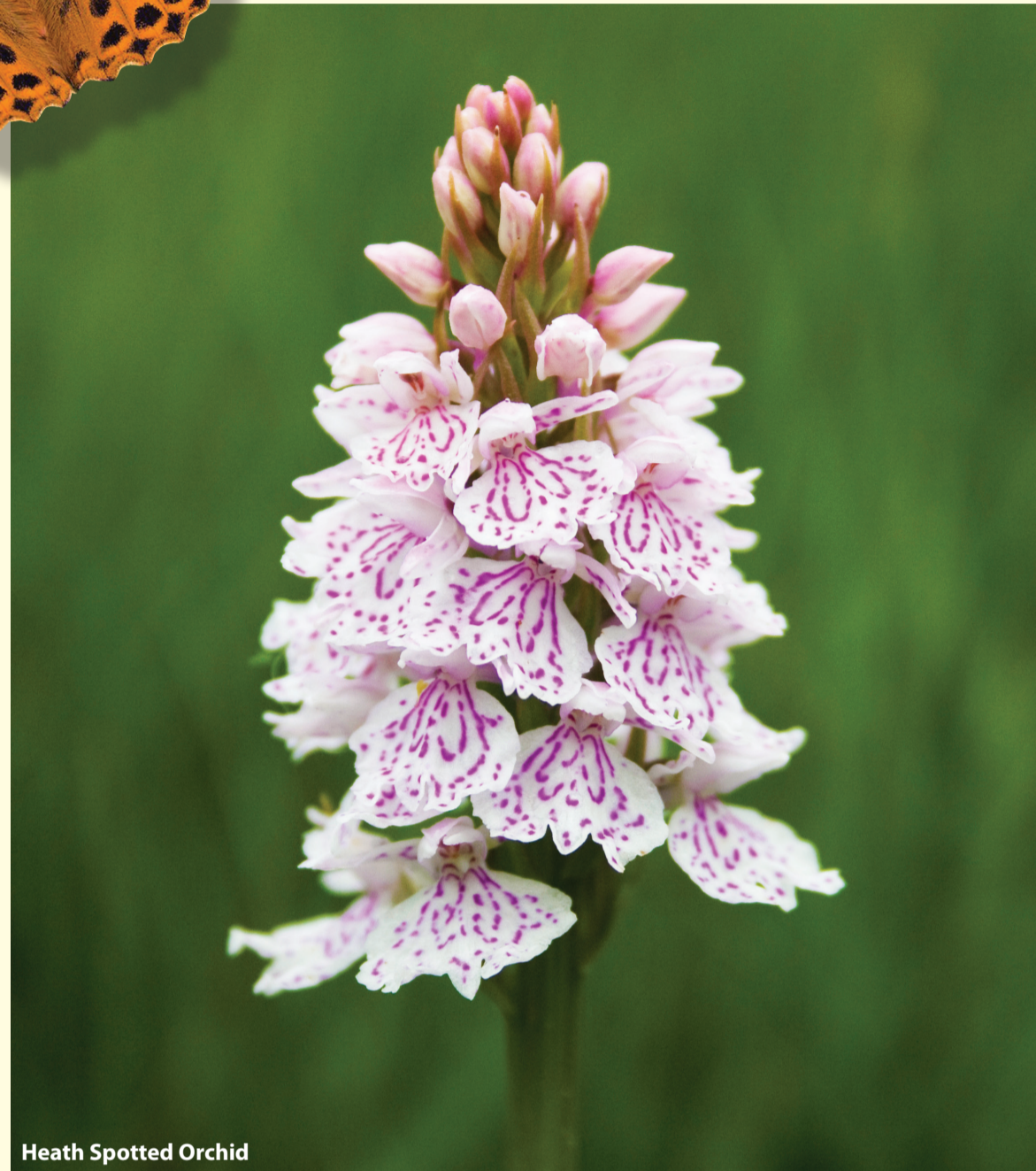
Heath Spotted Orchid

Because of the damp conditions and common status of the reserve, it was not reclaimed or improved for agriculture, thus enabling the survival of many important wildlife species. Plants present include Sneezewort, Meadow Thistle, Petty Whin, Pale Heath Violet, Early Purple and Heath Spotted Orchids. Around thirty butterfly species have been recorded including notables such as the Small Pearl Bordered and Silver-Washed Fritillaries. The bird population is also diverse, and includes Tree Pipit, Woodcock and Sparrowhawk.