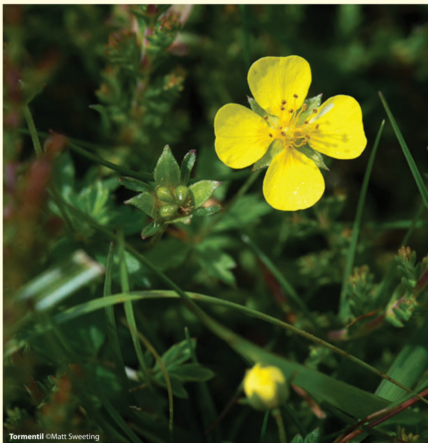
Tormentil

Ubley Warren Nature Reserve is a 35 hectare (87 acres) Site of Special Scientific Interest (SSSI), bought by Somerset Wildlife Trust from Bristol University in 1989.