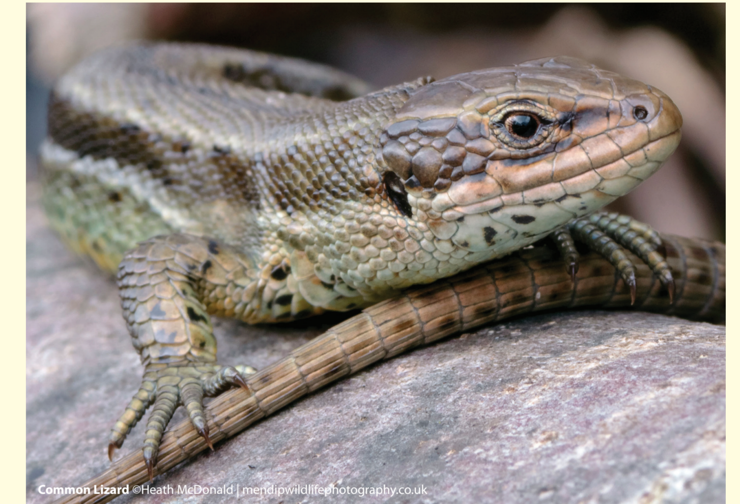
Common Lizard

This interpretation panel has been produced as part of Save Our Magnificent Meadows - a UK-wide partnership project to transform the fortunes of our vanishing wildflower meadows, grasslands and wildlife, primarily funded by the Heritage Lottery Fund. magnificentmeadows.org.uk